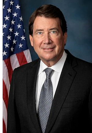
U.S. Sen. Bill Hagerty

pushing campaigns to defund the police and eliminate cash bail. This National Police Week, I stand proudly with our men and women in blue and believe that we must fund – not defund – our police. This legislation will provide much-needed resources for our law enforcement officers to hunt down violent criminals, restore law and order, and keep Tennesseans safe," said Senator Blackburn. "The American people have had enough of the violent crime wave sweeping our nation," said